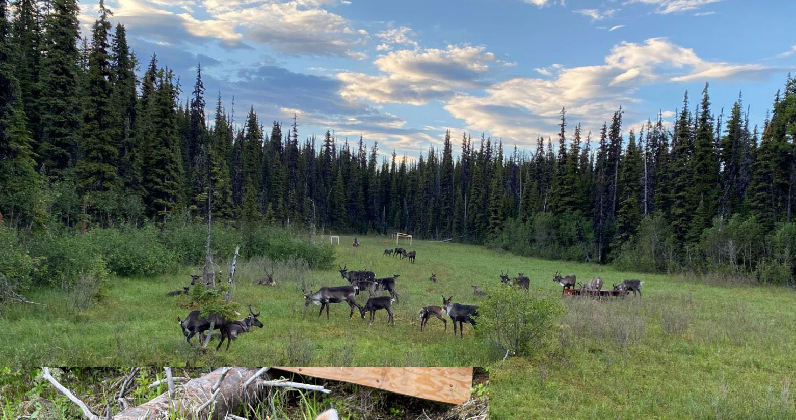
Left - All caribou (18 adult females & 16 calves in main meadow of pen, prior to release (Wildlife Infometric Inc)