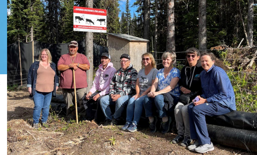
Right - Minister and DM visit at the pen, July 2022