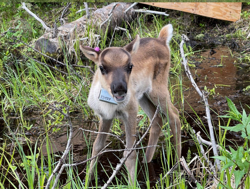
Left - orphan calf #38 at 3 weeks